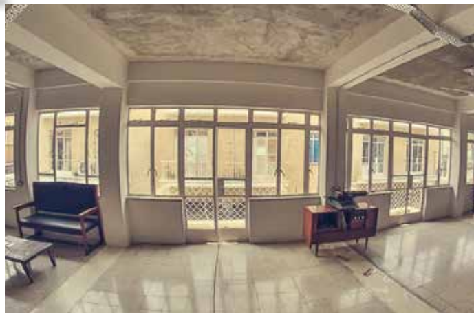
10/10 ART HALL

23:00 - Estimated arrival back to Hilton Park Hotel