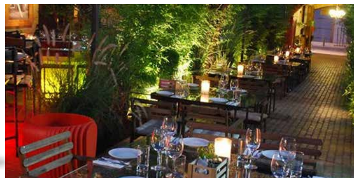
ERMOU 300 RESTAURANT